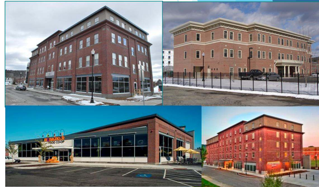
Railroad Square, Keene (Former B&M Railroad Property)